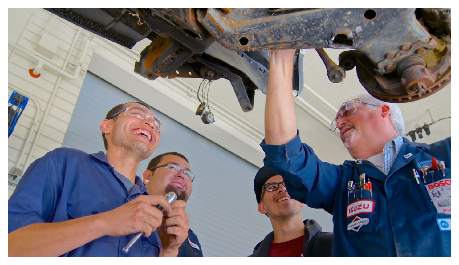
Rio Hondo Automotive Technology students with their instructor.