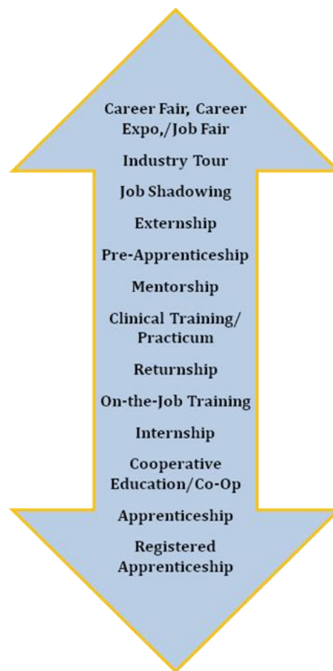
FIGURE 1: Types of Working Learning Programs