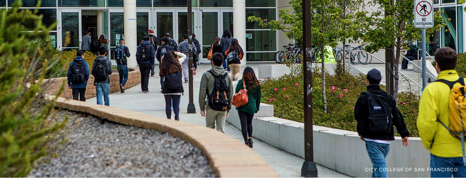
CITY COLLEGE OF SAN FRANCISCO