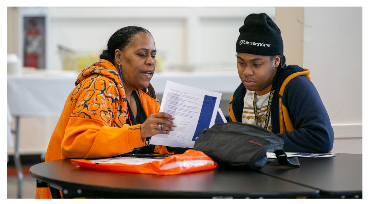
Parents and students were encouraged to participate at the Oakland Town Hall and College Fair on January 28, 2020

The Advisory Panel believes the recommendations made in this document, if properly resourced and invested, could help spark a movement leading to true transformation for Black and African American students in the California Community Colleges. To that end, the Advisory Panel has framed six major recommendations to directly address the most pervasive and entrenched barriers that hinder successful outcomes for Black and African American students. These recommendations closely align with California Community Colleges Chancellor Eloy Ortiz Oakley's Vision for Success (), which aims to reduce equity and regional achievement gaps through faster improvements among traditionally underrepresented student groups, with the goal of cutting these gaps by 40% within five years and fully closing those achievement gaps within 10 years.