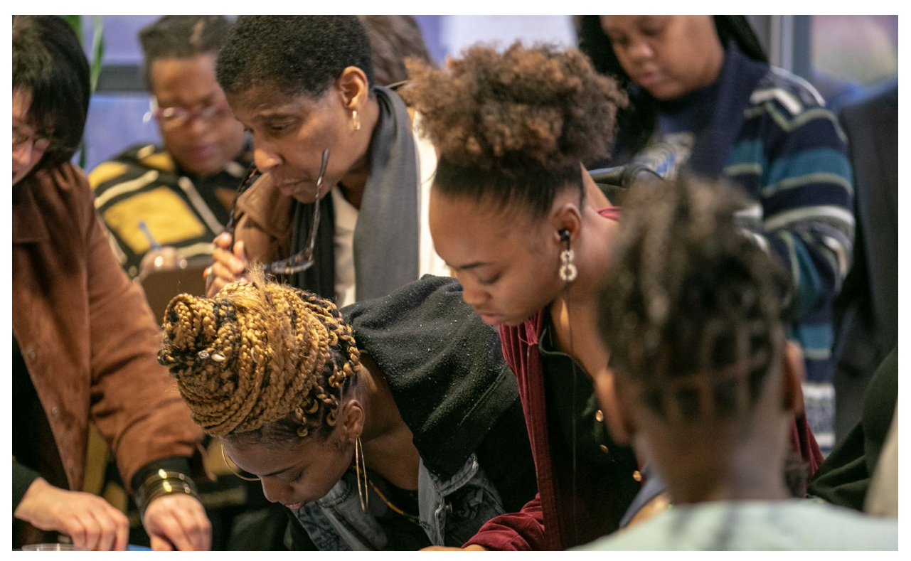
Students and parents signing in at the Sacramento Town Hall and College Fair on January 31, 2019