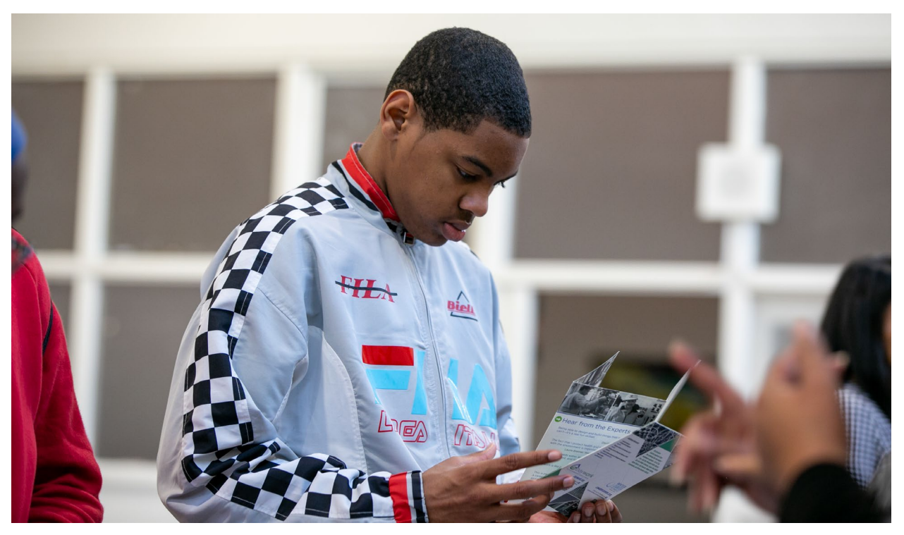
Students had a chance to interact with local community colleges during the Oakland Town Hall and College Fair on January 28, 2020