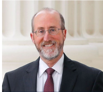
Sen. Steven Glazer (D-07)