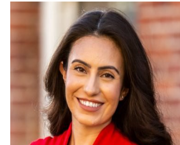
Sen. Sasha Perez (D-25)