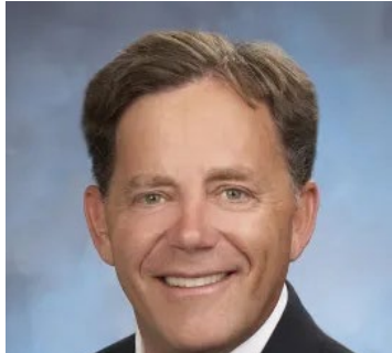
* Sen. Josh Newman (D-29)