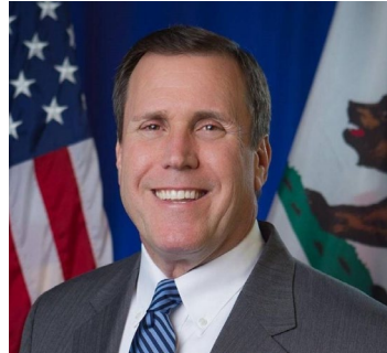
Sen. Scott Wilk (R-21)