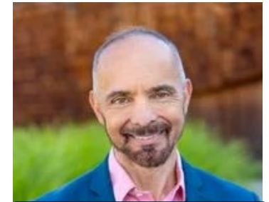
Sen. Christopher Cabaldon (D-03)