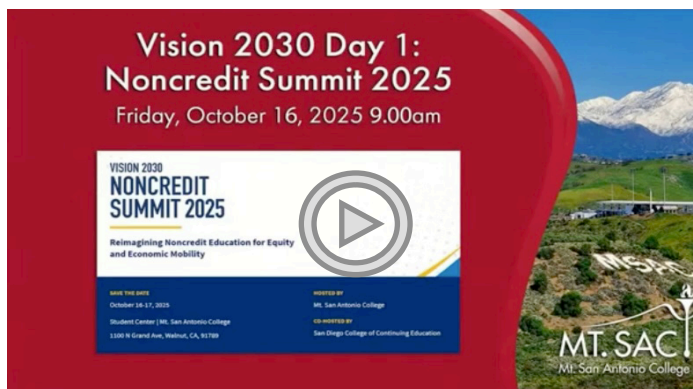
(VIDEO - Full video coverage of the Vision 2030 Non-Credit Summit held October 16-17, 2025.

In October, the California Community Colleges Chancellor's Office, in partnership with Mt. SAC and San Diego College of Continuing Education hosted the 2025 Noncredit Summit. This two-day Summit was grounded in Vision 2030 and highlighted the vital role of noncredit education in meeting the needs of today's adult learners. Through a focus on implementation, innovation, and alignment across institutions, the event offers strategies and fresh insights to help colleges develop and expand noncredit programs that drive student success and strengthen communities across the state. To learn more visit the Non-Credit Summit 2025 website , or watch the video of the event footage.