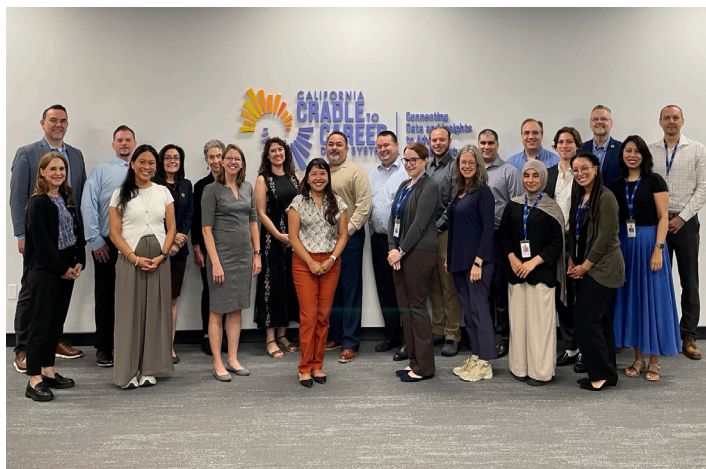
(PHOTO - WEDD team, Governor's team, and Cradle to Careers team at the in-person planning meeting in September)

In September, furthering the progress for Career Passports, the California Community Colleges Chancellor's Office (serving as the lead agency) convened with partners from the Governor's Office and the California Cradle to Career Data System to advance statewide planning efforts. This cross-sector collaboration supports California's vision for a connected, transparent talent pipeline that empowers learners, strengthens employer engagement, and drives regional economic mobility. To learn more, please read this PDF explaining the Career Passport program .