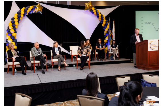
(PHOTOS - The WEDD Apprenticeship Team at the Advancing California Apprenticeship Summit)