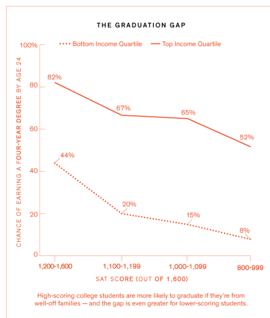
Figure 1. The Graduation Gap by Income Quartile (Tough, 2014)

In reflecting on such data, and likely on our own experience in the field, it is difficult to conclude that