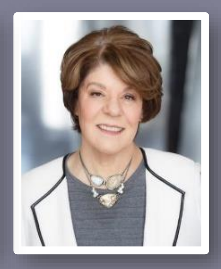
EDUCATIONAL EQUITY DIRECTOR, CENTER FOR URBAN

WEBINAR ONE IN THE SIX-PART SERIES THE IMPORTANCE OF EQUITY-MINDED VIRTUAL PRACTICES DURING COVID19: A CONVERSATION WITH STUDENTS